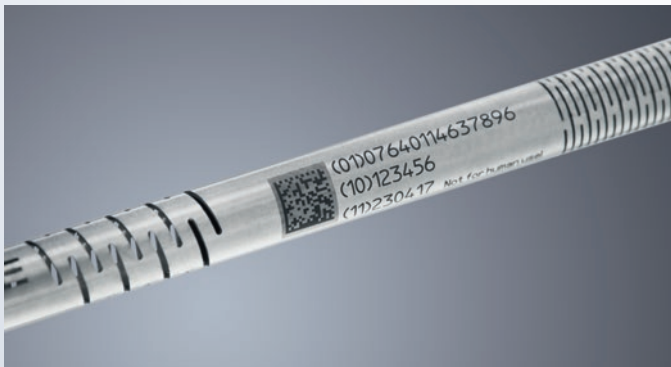
3D black marking on catheter (Alpine Laser)