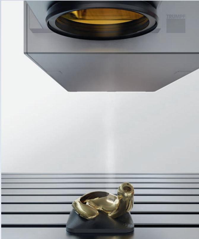
3D black marking with TruMicro Mark 1020 on an additively manufactured titanium hearing instrument