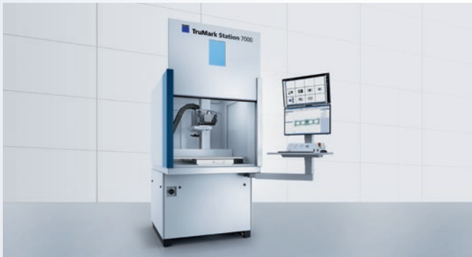
Turnkey solution: TruMicro Mark 1020 integrated in the marking system TruMark Station 7000