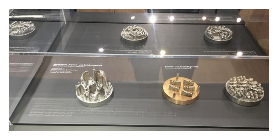
Substrate plates with 3D-printed dental prosthesis.