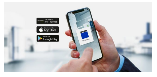
The TRUMPF Service app is available for download from Google Play or the Apple App Store.