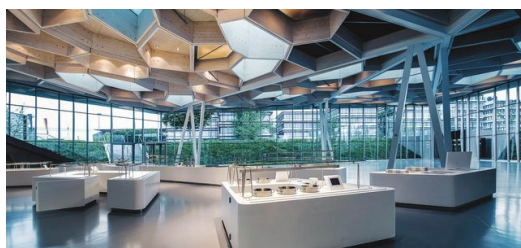
<p>Meeting place: The Blautopf is more than just a staff restaurant.</p>