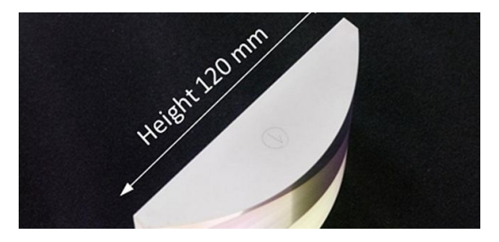
The large-format acylinders feature extreme aperture aspect ratios with a height of 120 millimeters and a length of 180 millimeters.