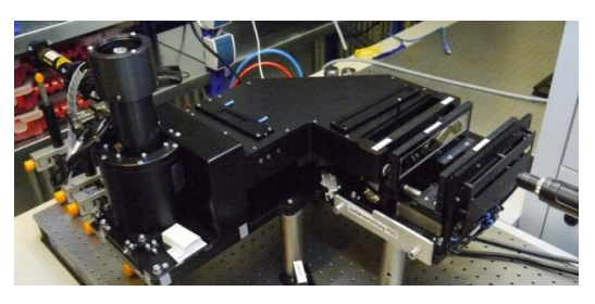
Setting up the performance test for the PSO assembly.