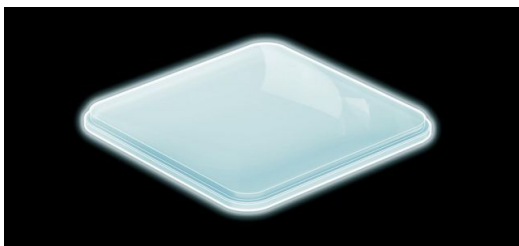
Saphir-Kameraabdeckung: Ultrakurze Pulse schneiden extrem harte