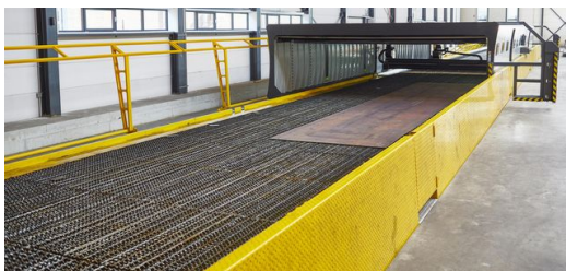
66 Meters – a table this long is perfect for even the largest sheets, and it also creates space for loading and unloading while the machine is cutting (Photos: Norbert Voskens).

You read that right: it takes just one person to operate this gigantic machine. Because the table is at ground level, inserting sheets is easy. "Instead of having to climb onto a table, the operator can simply load and unload the sheets using a ceiling crane," says den Oudsten. Once a sheet is in position, barriers at the sides tip up; then a booth moves over the sheet, covering it completely. Roller gates on both sides of the booth descend and cutting can begin.