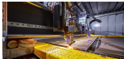
Two cutting heads equipped with 0.5 and 1 mm fibers can cut individually or in parallel.