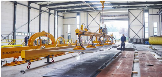
The Spanish eye-catcher cuts giant sheets and plates for truck bodies, ship hulls and buildings (Photos: Norbert Voskens).

Two cutting heads dance across the sheet, cutting the specified shapes. Both of these optical systems are mounted on a single portal that moves over the sheet in the direction of cutting. As soon as a sheet has been cut, the roller gates ascend and the booth moves on to the next sheet. "This approach allows us to cut five or even ten sheets in one go, depending on sheet size."