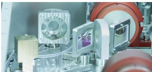
<div class="indent">Optics for laser amplifier in science. </div>

Ultimately there's one key thing that any potential entrepreneur needs to remember: if you're looking for an idea that amounts to more than just lines of code, you would be wise to take a careful look at what lasers can do. Or think carefully about what people who work with lasers need. Or at least mull over what lasers can do to help people who are planning something new – or who are simply looking to save the world.