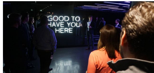
The words in the TRUMPF own tunnel system has been handcrafted exclusively for the company. Electrodes excite the gas in the tubes that form the words, making it light up.