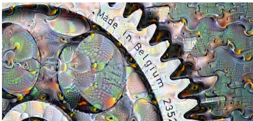
The dream in the workpiece?