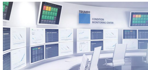
Algorithms and real TRUMPF experts then set to work transforming the data into trend analyses.