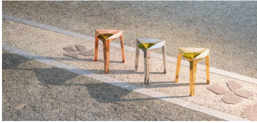
The "Orisu" chair in different colors: a symmetrical object, made of uniform parts and folded metal like origami.