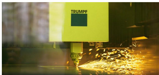
In March, FBT workers started using their new TruLaser 3030 to cut thin sheets and blanks to size.