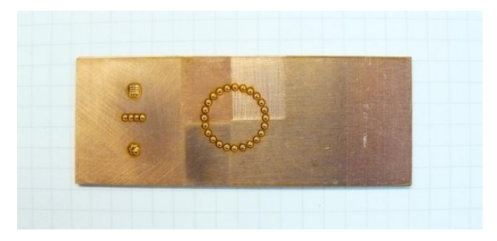
Regardless of whether the surface is oxidized, ground, sandblasted, rough, or polished to a high gloss, a green laser beam makes it possible to create welding seams in copper which are always of uniform quality.