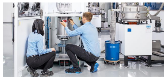
The construction cylinder is mounted in the unpacking station.