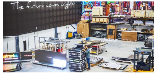
Tailor-made: Apametal develops and builds each digital sign itself.