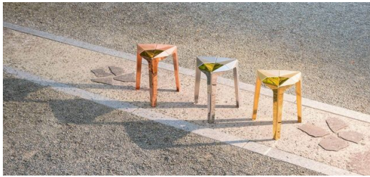
The "Orisu" chair in different colors: a symmetrical object, made of uniform parts and folded metal like origami.