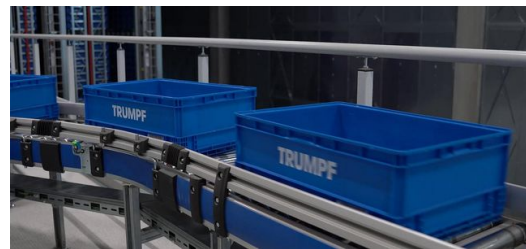
The first few meters on route to the customer: plastic bins contain up to four insert boxes for small parts.