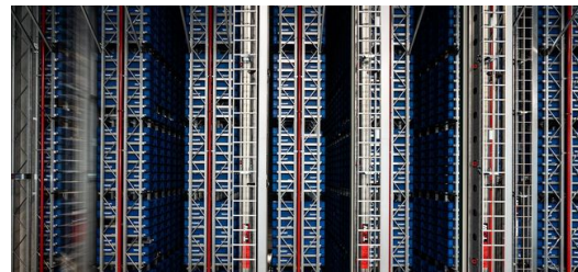
Innovative storage solutions – a system enabling an average of 3,500 picks per day.