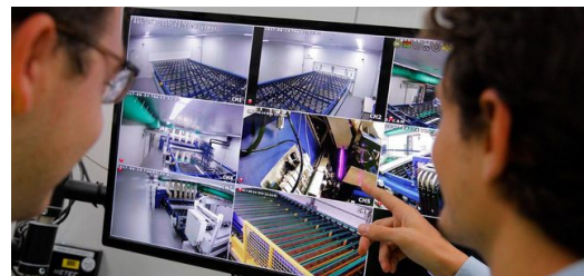
Heating the glass coating very briefly to a high temperature is an essential part of the hardening process. The glass experts at Saint-Gobain spent five years working on their rapid thermal processing method.