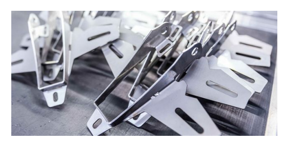
DELO Maschinenbau GmbH + Co. KG manufactures unusual parts and customized special machines. Customers expect the best processing quality for a fair price. Reliable machines are essential for Dennis Lozusic in order to keep up with the competition.