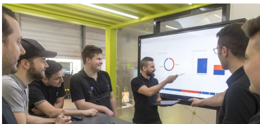
Every morning, workers of the sheet metal processing department gather in front of the screens.

The way that digitalization makes processes easier was also demonstrated in a tour of the TRUMPF in-house sheet metal processing unit. Before the visitors get to see the first machine, they all meet in the green area, the place where the workers meet every morning to coordinate the day's orders. Various screens show live production information and analyses of the machine utilization of the day before.