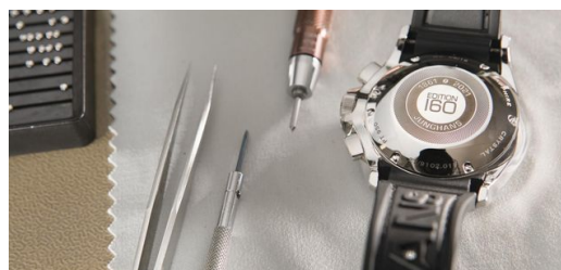
"A watch is simply not finished without the engraving," explains Matthias Stotz. The anniversary engraving is unmistakable with its fine structures, clean lettering and individual limitation number.