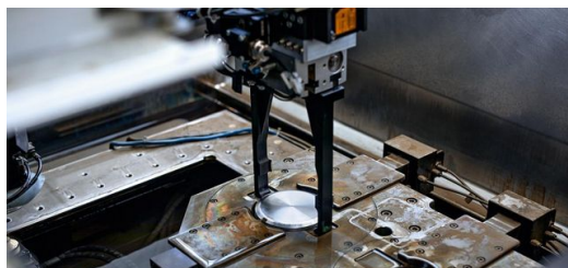
Since 2015, every blank is labeled with what is called a data matrix code.