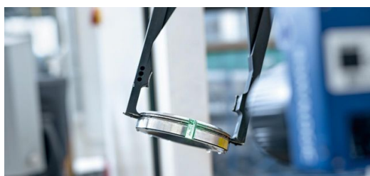
The use of data matrix codes helps standardize processes.