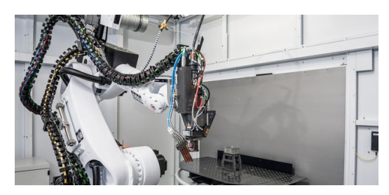
The laser network, serving a TruLaser 3030 ber and a TruLaser Robot 5020, expands the range of services offered by SCS by adding laser cutting and welding.