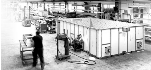
In one piece: Pools with standard dimensions are fully finished at Gassner and transported to the installation site on flatbed trucks.