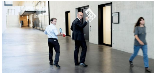
The team of people from the product group, development, purchasing, production, sales, service and project organization departments meets at regular intervals to discuss how development on the TruLaser Center 7030 is progressing.