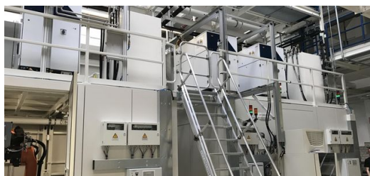
The CAMTRONIC section of the Mercedes-Benz plant in Berlin Marienfelde

This approach was the only means of optimizing the processing speed for series production of the component while at the same time guaranteeing the even hardening of all surface areas. Another major challenge was that of optimizing the hardening parameters and managing the sequence of different hardening requirements, especially when processing the hard-to-access parts of the shift gate. It was important not to cause any damage to the part's surface or alter its dimensions beyond the defined tolerance limits because it cannot be machined after hardening. It is also imperative to avoid distortion effects that might cause the cam pieces to stick in the camshaft guide.