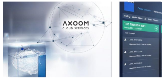
Some of the data is uploaded to the AXOOM Cloud via the Internet.