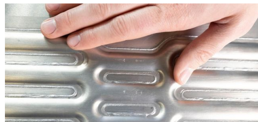
In the folding-box concept developed by BENTELER for a stainless steel battery housing, the patented TRUMPF solution BrightLine Weld ensures spatter-free processing and high-strength gas- and helium-tight weld seams, even in rapid series production.