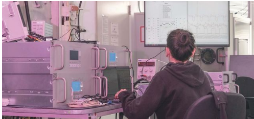
<p>An employee in the plasma laboratory analyzes the processes inside the chambers.</p>

customer side. The aim is to integrate the plasma generator into their process on a “plug-and-play” basis wherever possible: “The focus is on what the customer wants to accomplish. We show them what results they can achieve if they choose the right settings,” says Gajewski as he walks through his laboratory with its numerous plasma chambers. This is where his team simulates applications from the high-tech factories of this world. At the end of each experiment is a kind of instruction manual: for scratch-resistant smartphone displays, innovative coatings for solar cells and particularly fine structures on semiconductors.