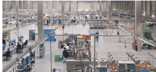
<p>Special generators for every application: Generators for the semiconductor industry are created from numerous components some of which are manufactured automatically.</p>