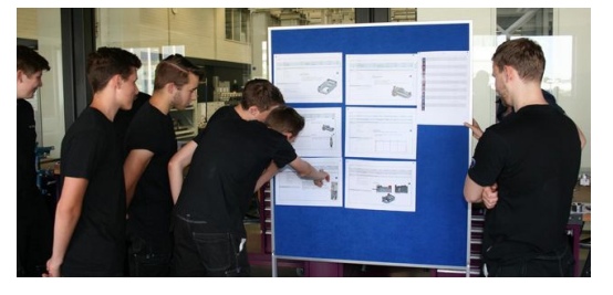
That 's why the training department want s to move with the times by using the methodologies that currently have priority within the company and are in widespread use.