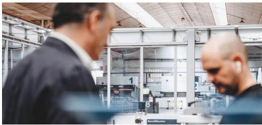
One big family: Everyone at Lasercor plays their part – and they trust each other to come up with pragmatic solutions.