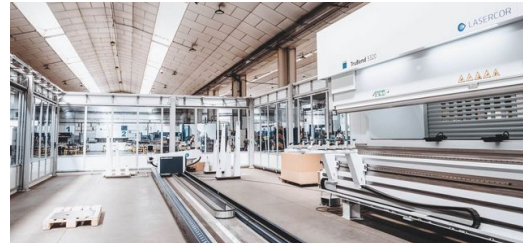
All Lasercor machines from TRUMPF are already networked with each other.