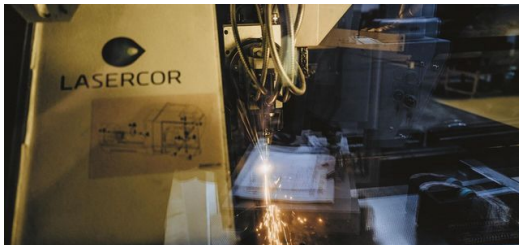
Laser cutting, welding and engraving: Lasercor uses a wide range of TRUMPF solutions.