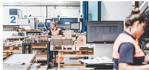
Getting everyone involved: Every part of the Spanish company was involved in the stadium project.