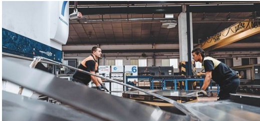
The father and sons decided that they needed a laser cutting machine to close the supply gap and to produce suitable sheet metal parts themselves.

production site, and the company now has a total of 23 TRUMPF machines, from the TruBend 5130 and TruLaser 5030 fiber to the TruLaser Weld 5000 and TruMark Station 7000 . Today, the company employs 170 people and has an annual turnover of 30 million euros. Using TRUMPF machines, Lasercor has cut, bent, engraved and welded parts of all shapes and sizes for some 8,000 customers. Their work ranges from one-off jobs for small businesses to standing orders for major corporations, and their customers make everything from road signs and household appliances to machines, entire plants and large wind turbines. And now that list includes the world-famous Santiago Bernabéu Stadium.