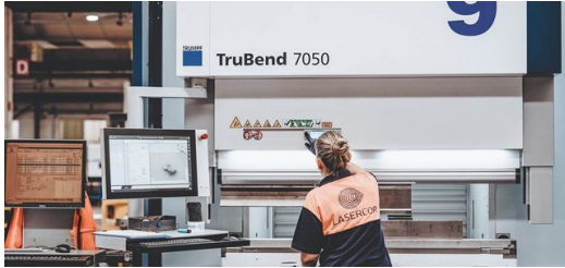
Lasercor has used TRUMPF machines to cut, bend, engrave and weld parts of all kinds for around 8,000 customers.