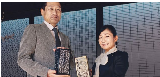
Top-sellers: Each lantern is unique, featuring its very own complex geometric pattern.

Producing aluminum is an energy-intensive process, however. This wasn’t a good fit with Ueki’s sustainability goals, so the decision was made to use regionally produced Japanese iron instead. The production process requires significantly less energy, and the resulting iron can easily be maintained in good condition and stored for an almost indefinite period. The journey from the initial business idea to the first respectable prototype of a Kumiko component took more than a year. But the superior quality of the results was well worth the wait. “The inspiration of traditional Kanuma Kumiko techniques is clearly visible. And our ability to successfully produce so many different geometries ultimately comes down to the outstanding precision of the TRUMPF laser system. The machine has brought us very close to meeting our goal of absolute symmetry,” says Nakamura.