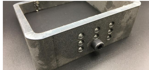
The TruLaser Tube 7000 can be used to fabricate a range of different threads in tubes.

Since the summer of 2017, the company's plant in the Swabian Jura region has been using a test unit of the TruLaser Tube 7000 laser tube cutting machine with integrated tapping system. "We are delighted to be working with TRUMPF on this kind of collaborative project, and we are certainly impressed with the new technology," says Frank Steinhart. The CO2 laser cuts tubes and profiles without leaving burrs and offers bevel cuts of up to 45 degrees, diameters up to 254 millimeters and wall thicknesses of between one and ten millimeters.