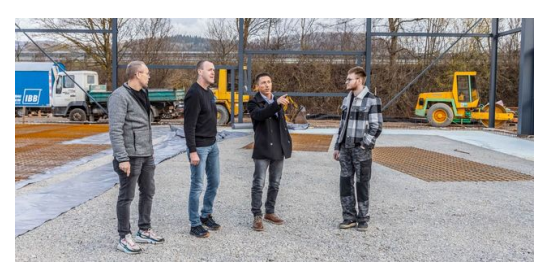
DELO is planning on relocating to neighboring Hechingen in September 2023. Construction work is in full swing. With a developed area of 2,000