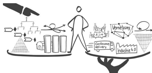
For a flexible organization, you need both stability and agility.