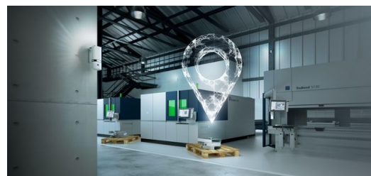
This enables sheet-metal manufacturers to track orders, load carriers and means of transport and thus optimize processes.