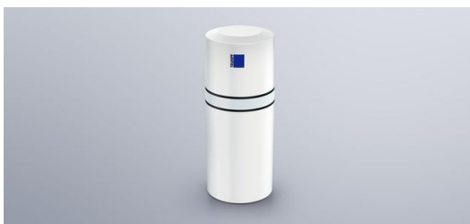
Satellite: Satellites installed in the production facility pick up the markers' location and transmit the information to an industrial PC.