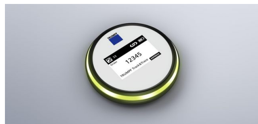
Marker: Users can transfer the order number and other information digitally onto the e-ink display of the marker. They can then simply place them on or beside the parts of the order.