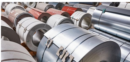
To ensure his company can supply all customers within 48 hours, Wagner maintains a well-stocked warehouse. Apart from sheet steel between 0.75 and five millimeters in thickness, the company also processes galvanized sheet steel, aluminum, titanium zinc, copper and stainless steel.