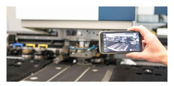
<span lang="EN-US">Remote diagnosis and error correction using the Visual Assistance function integrated into the TRUMPF Service app allows TRUMPF technicians to connect to the customer's cell phone or tablet camera.