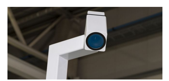
A high-resolution camera captures every part that is removed. The intelligent image processing of the Sorting Guide reliably detects it and reports the removal to the TruTops Fab production control.