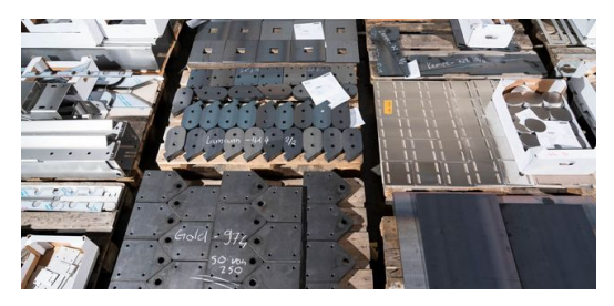
Every week, Rolf Lasertechnik GmbH & Co KG produces around 2,500 laser blanks and processes around 6,000 metric tons of raw material for this number.