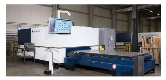
In test operation, the Sorting Guide was installed on a TruLaser 5040 fiber In the meantime, Tobias Rolf has invested in a new TruLaser 5030 fiber - again with the Sorting Guide, of course.

The Sorting Guide from TRUMPF now makes life a lot easier for these people. In test operation, the camera-based assistance system was initially installed on a <a href="TruLaser 5040 fiber">TruLaser 5040 fiber</a> machine. The Sorting Guide consists of a high-resolution camera, a large screen and image recognition software. On the screen, the operator sees an image of the sheet on which all the parts that belong together are marked in one color. As soon as he has removed the first part, the camera recognizes which part it is, and the Sorting Guide only shows the parts in color that match the removed part. This provides the operator with a sorting recommendation. In addition, the information about which parts are being removed is sent to the <a href="TruTops Fab">TruTops Fab</a> production control system, where they are marked for posting until the end of the sorting process. Rolf summarizes: "The Sorting Guide is easy to use, reduces the workload of our employees and minimizes the error rate enormously. If I assume a sheet on which several customer orders are placed, the saving in working time from programming to removal preparation to sorting amounts to around one hour per day." In a company that relies on fast turnaround times, that's a big deal.