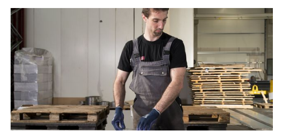
In the past, sorting out laser-cut parts was tedious puzzle work for operators. Printed views of the nesting programs served as orientation.