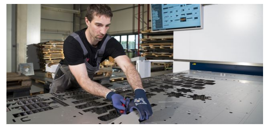
Today, all it takes is a glance at the Sorting Guide screen. The operator is shown a removal proposal on the large screen. All parts that belong to an order are color-coded.