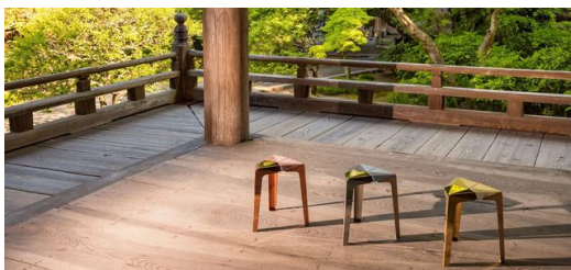
<p>The "Orisu" chair is something special: it makes abstract technologies visible to the viewer.</p>