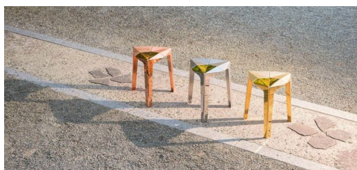
<p>The "Orisu" chair in different colors: a symmetrical object, made of uniform parts and folded metal like origami.</p>