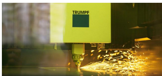
In March, FBT workers started using their new TruLaser 3030 to cut thin sheets and blanks to size.