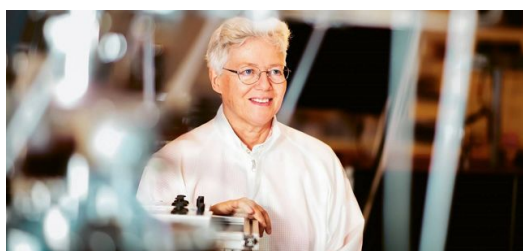
Professor Anne L'Huillier once unlocked the door to the physics of attosecond laser pulses. Her current research now focuses on electrons.

L'Huillier: It is difficult to provide a well-defined vision. We are currently doing the fundamental research.