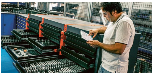
An impressive range of tools leaves plenty of scope for new punching ideas.