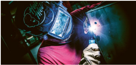
Ripleg offers the complete sheet-metal process chain at its 7,000-square-meter facility. Its portfolio punching and laser cutting, bending, welding, painting and final assembly of products.