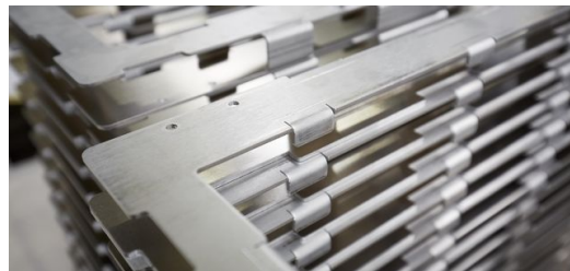
The front panel of a pay-and-display machine.