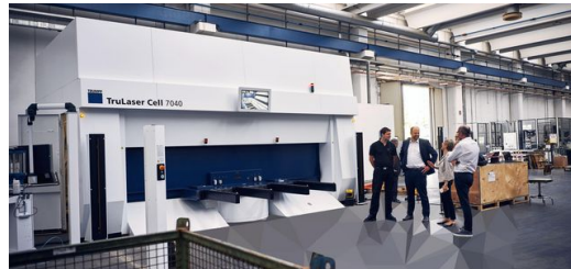
The TruLaser Cell 7040 in the production hall of Omas S.p.a.