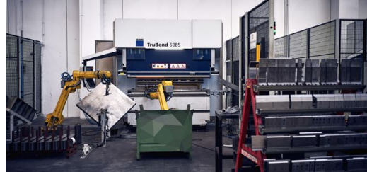
Robot colleague: For the employees at Omas S.p.a., robots have long been part of everyday life.