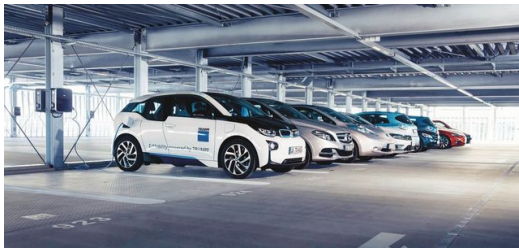
<p>Electric charging station: Employees in Ditzingen have access to 86 charge points in the company’s own parking garage. TRUMPF is also electrifying its vehicle fleet.</p>