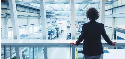
<p>Smart factory: TRUMPF offers numerous technologies that help improve manufacturing companies’ environmental footprints.</p>