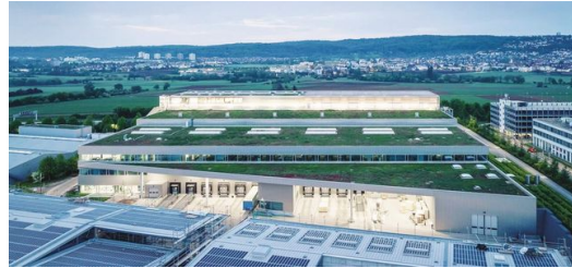
<p>Power from the rooftops: TRUMPF is steadily expanding its in-house generation of renewable energy through sources such as large photovoltaic systems.</p>