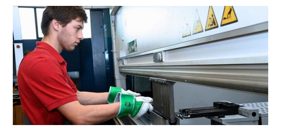
Assistance systems and software help with the work: The TruBend 5230 in use at the Fischer company.