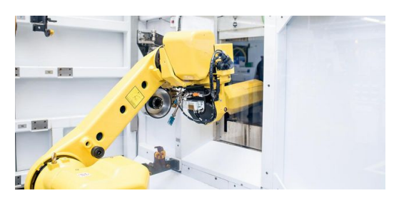
Start of production: The punching tools start their journey in the punching tool factory in Gerlingen, Germany.