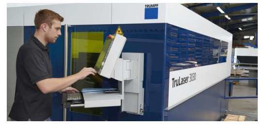
Christoph Siegl is particularly impressed by the Drop&Cut function, an unrivaled solution for quick post-production.

In spite of the fact that another machine tool manufacturer was close by, the Sigels traveled to the TRUMPF show room in Ditzingen. The quality of the specimen parts was just as convincing as the rugged engineering of the TruLaser 3030 fiber. "The machine is really made for shop use. Every detail has been thought out entirely," acknowledges Christoph Sigel. "I was particularly impressed by the Drop&Cut function, an unrivaled solution for quick post-production." Drop&Cut uses a camera to transmit a live picture of the machine's interior right to the display at the control terminal. A mouse click or touching the screen is su=cient to project the geometry of the desired part onto the remaining plate. Parts can be positioned and turned, inside the camera's field of view, on the sheet metal. Here outlines can be rotated, shifted, copied or deleted as desired. Christoph Sigel: "Post-production couldn't be any easier."